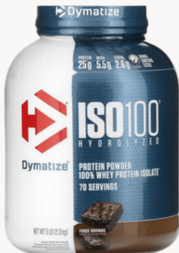
ISO100 - 5lbs $118.99

25g hydrolyzed isolate; clinically backed for muscle growth. Why: Top tier for serious athletes; zero sugar for clean cuts.