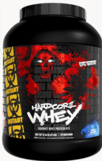
HARDCORE WHEY - 5lbs $84.99

Blend with BCAAs. Why: Enhanced recovery formula.