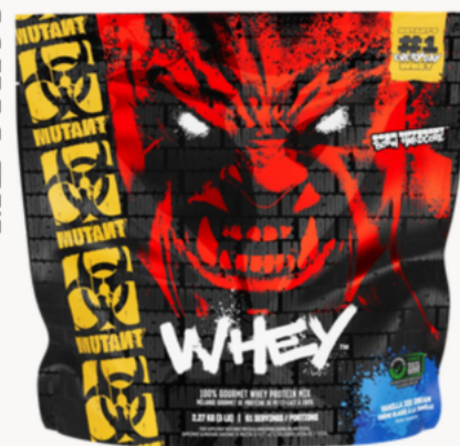
WHEY - 5lbs $68.99

Affordable mass building whey. Why: Solid choice for budget gains.