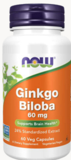
Ginkgo Biloba 60mg 60 VCaps - $19.99

Bone health combo. Why: Complete mineral stack.