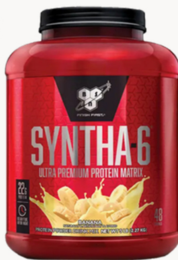
SYNTHA-6 - 5lbs $74.99

Multi protein matrix with rich taste. Why: Filling and delicious for long term adherence.