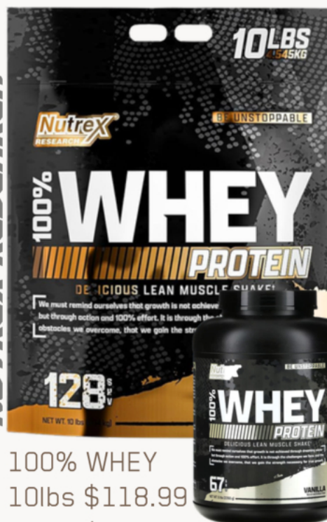
100% WHEY 10lbs $118.99 5lbs $67.99

Bulk whey for heavy users. Why: Cost effective per serving for committed bulkers.