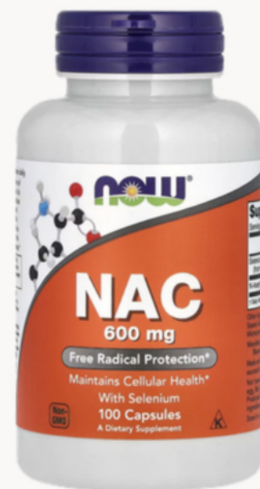
NAC 600 mg (N-Acetyl Cysteine) 100 VCaps - $21.99