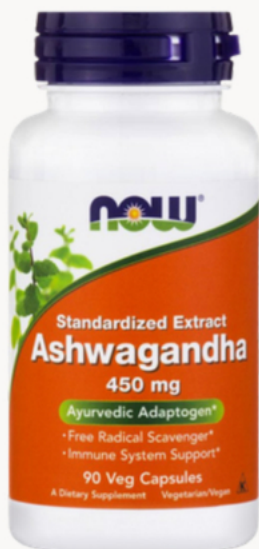
Ashwagandha Extract 450mg 90 VCaps - $19.99

Adaptogen for stress reduction. Why: Improves energy and focus.