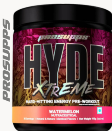
HYDE Extreme - 420mg Caf 30sv - $37.99