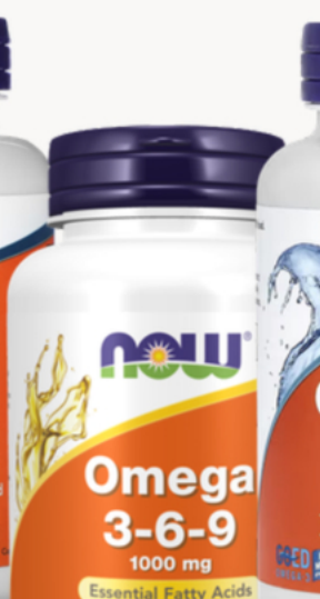
Omega 3-6-9 100 Softgels - $21.99

High EPA/DHA for heart/brain. Why: Anti inflammatory for joint health.