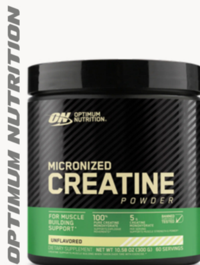
Micronized CREATINE 300g - $29.99