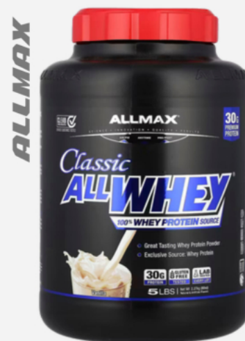
Classic All Whey - 5lbs $74.99

Why: Great value for consistent muscle repair in humid weather.