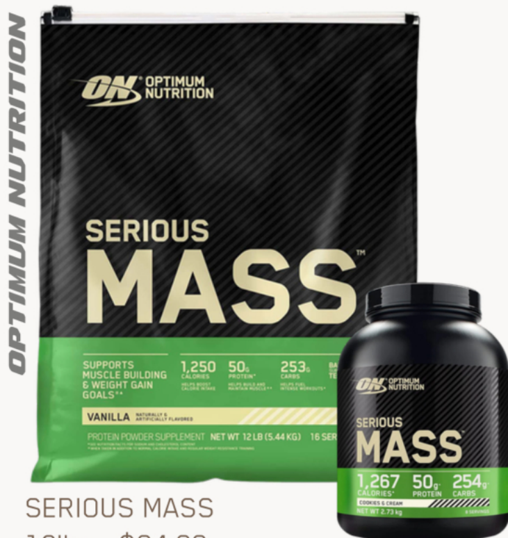
SERIOUS MASS 12lbs - $94.99 6lbs - $57.99

Starter size. Why: Test before committing to bulk.