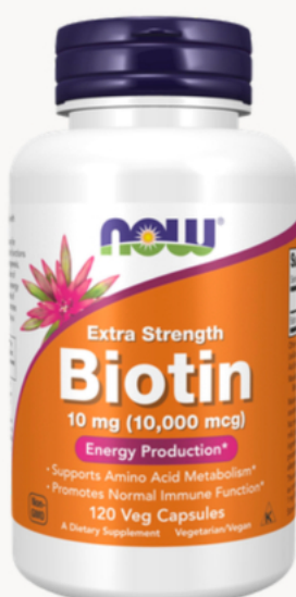
Biotin 10mg 120 VCaps - $23.99

Adaptogen for stress reduction. Why: Improves energy and focus.