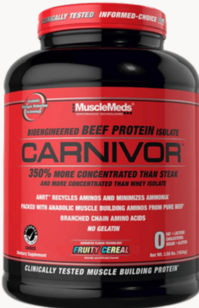
Carnivor - 4lbs $74.99

Anabolic beef protein. Why: Lactose free power for muscle.