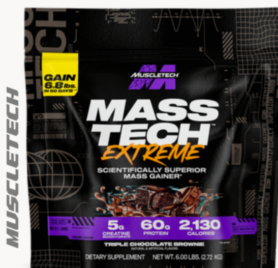
MASS TECH EXTREME 12lbs - $89.99 6lbs - $54.99

Beef based gainer for anabolic growth. Why: Dairy free bulking. High protein without whey.