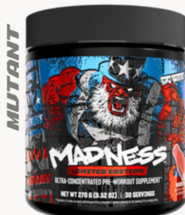
Madness™ 360mg Caf 30sv - $33.99