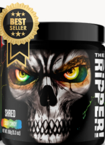
The Ripper - Fat Burning Pre-Workout 200mg Caf 30sv - $33.99