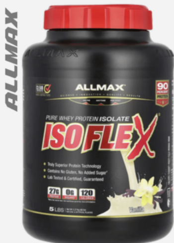
ISO FLEX - 5lbs $104.99

27g pure whey isolate per scoop; low-carb, lactose free for fast absorption and lean gains.