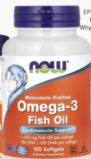
Omega-3 | 100 Softgels - $17.99

Why: All in one essential fats for healthy skin, joints & overall wellness.