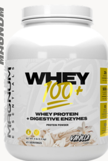
WHEY 100+ 5lbs $67.99

High quality blend. Why: Supports quick recovery.