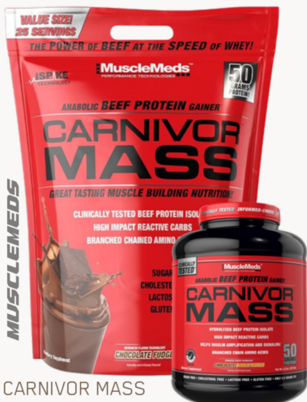
CARNIVOR MASS 12lbs - $89.99 6lbs - $59.99

Advanced gainer with real food sources. Why: Natural alternative.