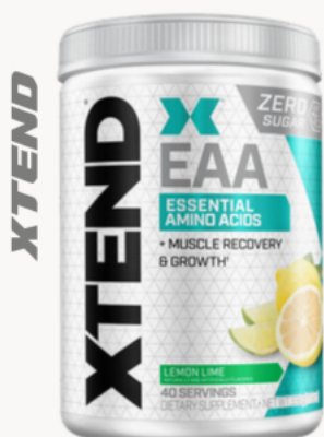
Xtend EAA 40sv - $37.99

Essential amino acids for recovery. Why: Hydrates and repairs muscles.