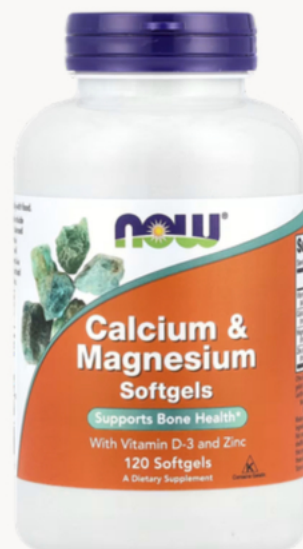
Calcium & Magnesium w/ Vitamin D-3 & Zinc 120 Softgels - $17.99

Lower dose for maintenance. Why: Daily support.