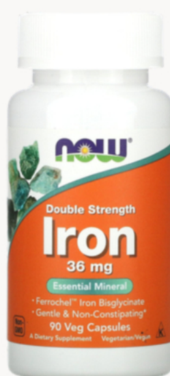
Iron 36mg 90 VCaps - $17.99

Joint support. Why: Reduces workout wear.