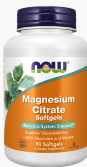
Magnesium Citrate w/ Glycinate & Malate 90 Softgels - $19.99

High absorption form for calm. Why: Better sleep and recovery.