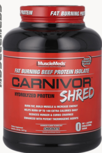
Canivor SHRED - 4lbs $77.99

Beef protein with fat burners. Why: Alternative to whey for variety or dairy free.