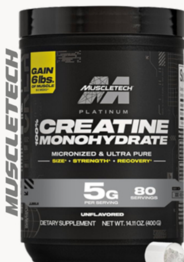
100% Creatine Monohydrate 400g - $37.99