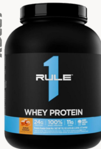
Whey Protein - 5lbs $74.99

24g blend protein. Why: Reliable for daily gains.