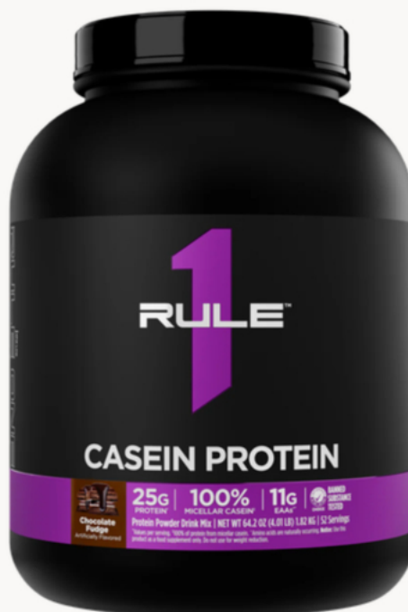
Casein Protein 4lbs - $94.99

Plant-Powered Nutrition Per serving, Plant Protein provides 20 grams of quality protein, with all 9 essential amino acids (EAAs), from a blend of pea, sunflower seed, pumpkin seed, and watermelon seed sources. Equally impressive is what's not in it. Plant Protein is naturally flavored, sweetened with stevia leaf extract, and contains no artificial food dyes. Dairy, lactose, and cholesterol free.