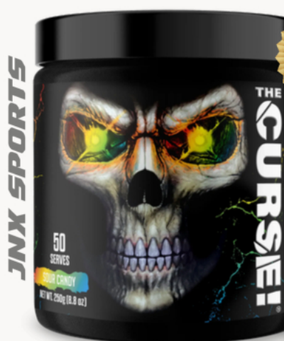
The Curse - Pre-Workout 155/360/465mg Caf 50sv - $33.99