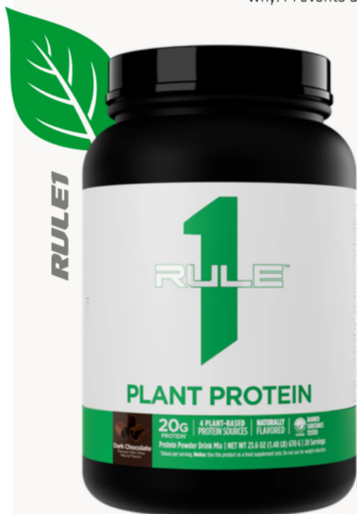
Plant Protein 20sv - $44.99

Daily vitamins/minerals. Why: Fills nutrient gaps for overall health.