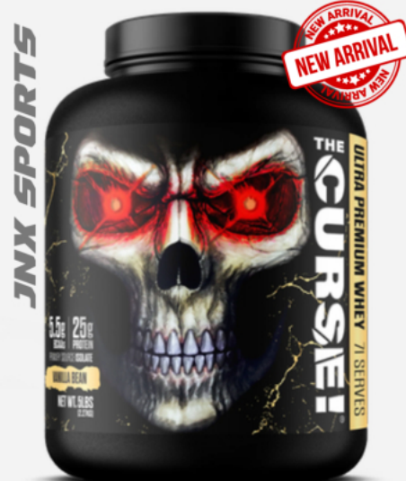
The Curse! Ultra Premium Whey - 5lbs $74.99

Bold-flavored whey with 25g protein. Why: Adds excitement to routines; high quality for motivation.