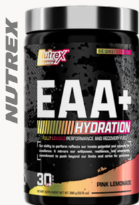
EAA+ Hydration 30sv - $29.99

Essential amino acids for recovery. Why: Hydrates and repairs muscles.