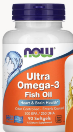
Ultra Omega-3 Fish Oil 90 Softgels - $27.99

Why: Boosts immunity in tropical climates.