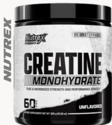
CREATINE MONOHYDRATE 300g - $27.99