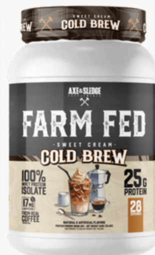
Farm Fed - 2lbs $57.99

Grass fed whey; natural and clean. Why: Ethical sourcing for wellness focused buyers.