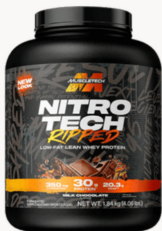
Nitro Tech RIPPED - 4lbs $77.99

30g protein with fat burners like CLA. Why: Dual action for lean definition and strength.