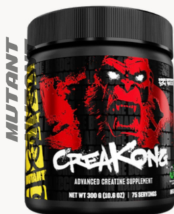
CREAKONG 300g - $29.99