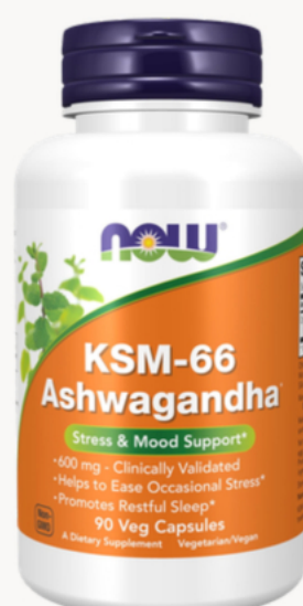
KSM-66 Ashwagandha 90 VCaps - $32.99

Supports red blood cell production and oxygen transport, helping prevent anemia and reduce fatigue especially vital for women during menstruation, pregnancy, or reproductive years. Why: Boosts energy, immunity, and healthy hair/skin/nails.