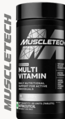
Platinum Multi Vitamin 90 Caps - $19.99

Aminos + caffeine for focus. Why: Versatile intra workout boost.