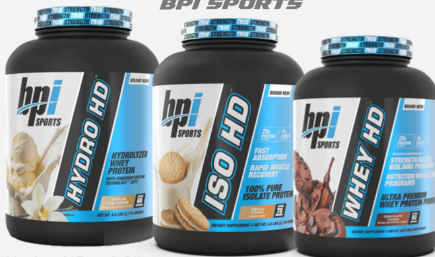
Hydro HD - 4.8lbs $94.99

Why: Versatile for shakes or recipes; budget friendly for everyday use.