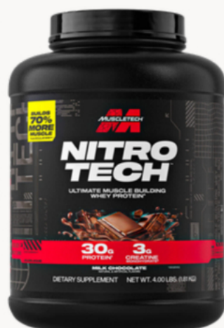
Nitro Tech - 4lbs $77.99

30g protein + 3g creatine; builds 70% more muscle than standard whey. Why: Proven for gains in 6 weeks.