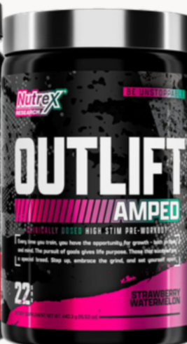
Amped - 400mg 22sv - $39.99