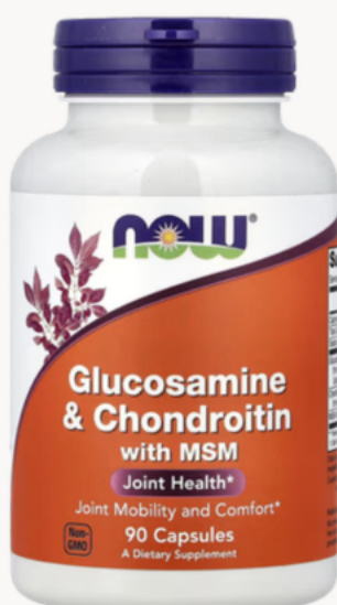
Glucosamine & Chondroitin Plus MSM 90 VCaps - $25.99

Brain circulation. Why: Enhances mental sharpness.