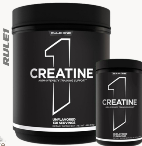
CREATINE 130SV (680g) - $49.99 75SV (390g) - $29.99