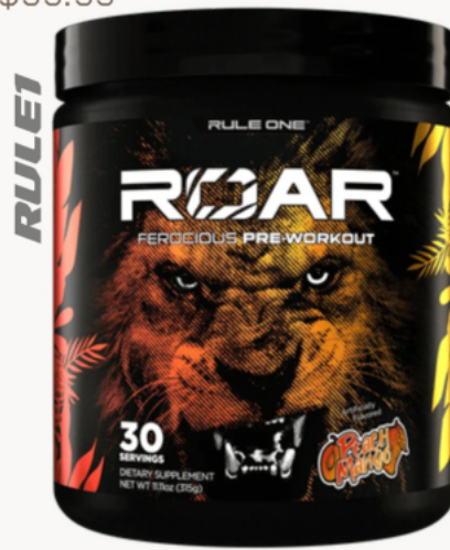
Roar Ferocious Pre-Workout 175mg Caf 30sv - $32.99