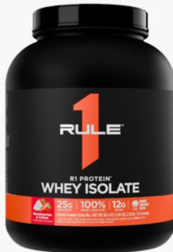
ISOLATE - 5lbs $94.99

Pure isolate with minimal ingredients. Why: Transparent formula for clean eating.