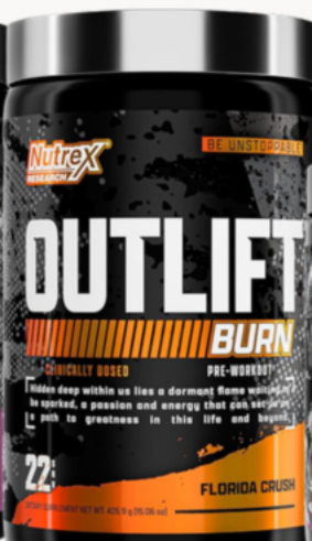
Burn - 375mg 22sv - $39.99