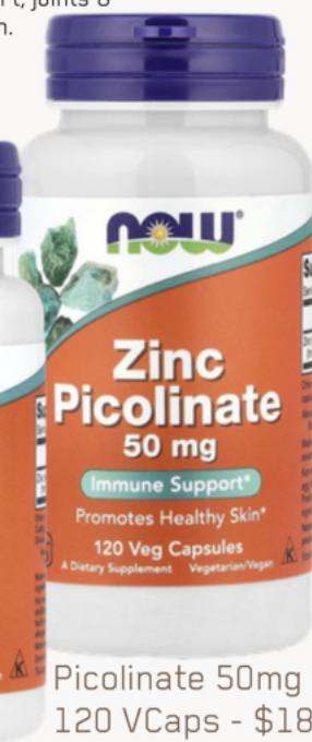
Zinc Picolinate 50 mg 120 VCaps - $18.99

Why: Boosts immunity & vitality key for energy & glow in daily life.