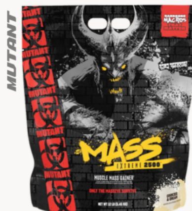
MASS EXTREME 2500 - 6lbs $48.99

Mid size option for steady progress. Why: Balanced for beginners.