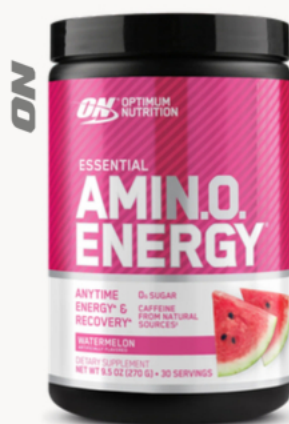
AMIN.O. Energy 30sv - $32.99

EAA's with electrolytes. Why: Prevents dehydration in hot weather.