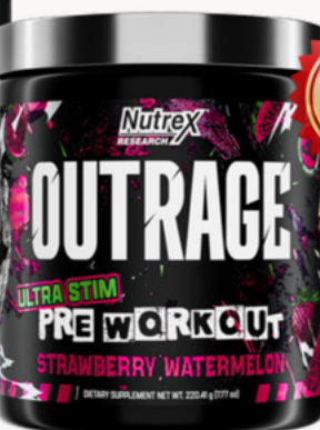
Outrage - Ultra Stim 400mg 30sv - $32.99