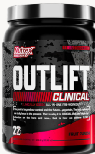
Outlift Clinical - 380mg 22sv - $39.99