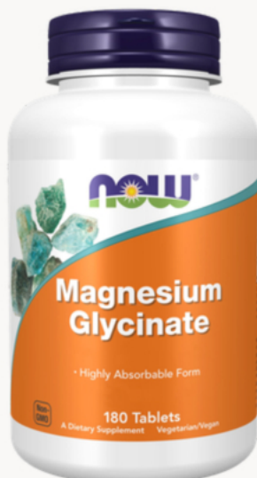
Magnesium Glycinate 180 Tablets - $31.99

Supports nerve/muscle function. Why: Relaxes muscles post-workout.