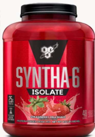
SYNTHA-6 ISOLATE - 4lbs $77.99

Slow release isolate for sustained energy. Why: Great as a meal replacement.