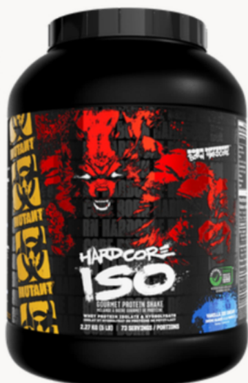
HARDCORE ISO - 5lbs $94.99

High purity isolate. Why: For hardcore athletes seeking max results.