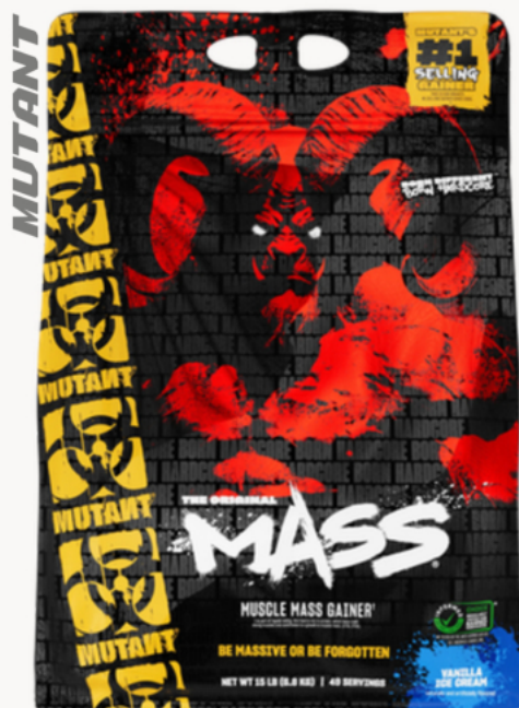
MASS - 15lbs $88.99

Multi carb blend for energy. Why: Sustained fuel for workouts.