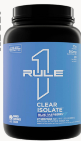
Clear Isolate 1.5lbs $64.99

Fruit flavored, zero lactose. Why: Light and refreshing for non dairy users.