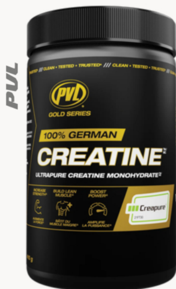
100% German @Creapure 410g Unflavored - $37.99