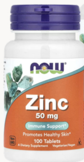
Zinc 50 mg 100 Tablets - $14.99

Why: Pure, distilled support for heart, joints & energy great daily addition.