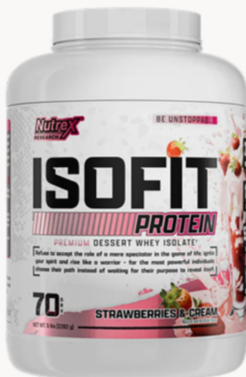
ISOFIT - 5lbs $84.99

25g isolate with gourmet flavors, low calories. Why: Tasty option without compromising goals.