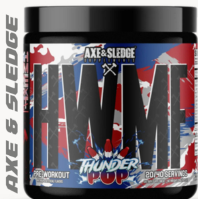
Hard-Working Motherf*cker 400mg 20/40sv - $43.99