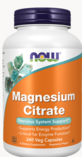
Magnesium Citrate 240 VCaps - $37.99

Supports nerve/muscle function. Why: Relaxes muscles post-workout.