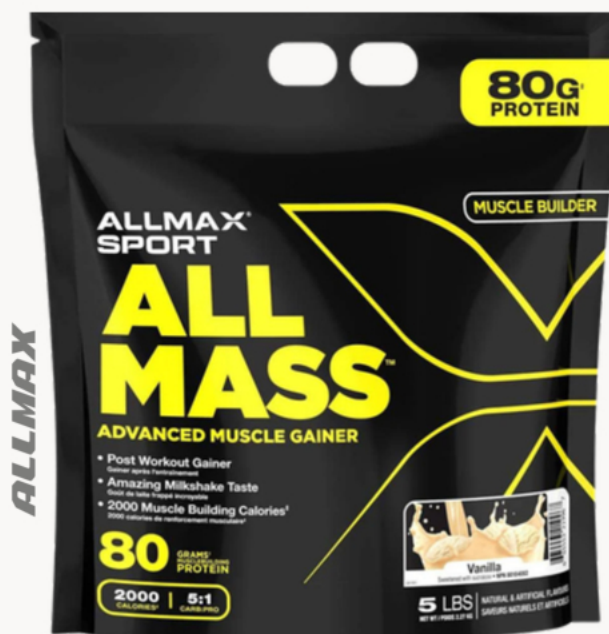
ALLMASS SPORT - 5lbs $54.99

Multi carb blend for energy. Why: Sustained fuel for workouts.