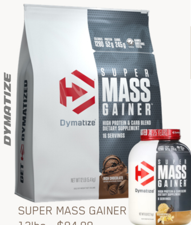
SUPER MASS GAINER 12lbs - $94.99 6lbs - $64.99

1,250 calories, 50g protein + vitamins/creatine. Why: Proven for hardgainers; adds muscle without fat.