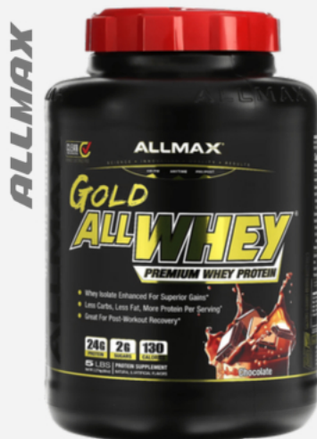
Gold AllWhey - 5lbs $84.99

Why: Perfect for cutting phases; mixes smoothly with no bloating, ideal for beginners or lactose sensitive users.