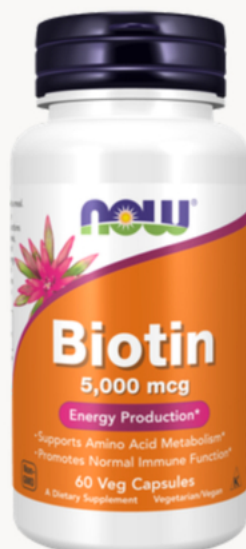
Biotin 5mg 60 VCaps - $17.99

For hair/skin/nails. Why: Beauty from within.