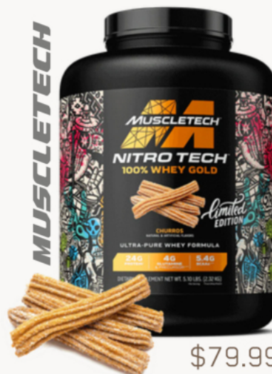
$79.99 Nitro Tech 100% Whey Gold - 5lbs

Premium peptides for rapid absorption. Why: Elite recovery for high performance training.