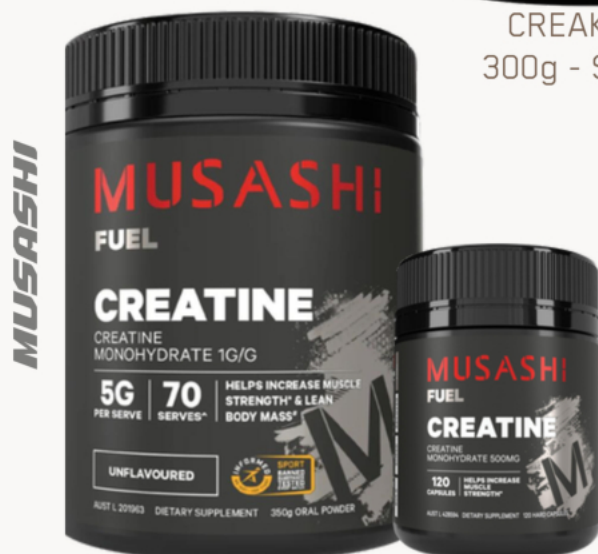
CREATINE 350g - $34.99 120 Capsules - $27.99